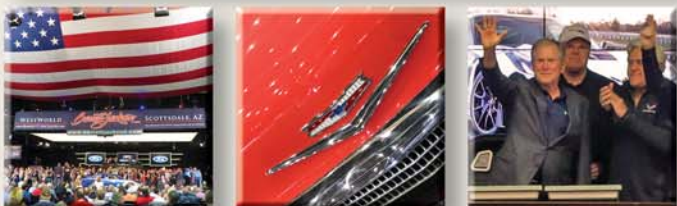
Bullitt and Bush-Leno photos courtesy Barrett-Jackson