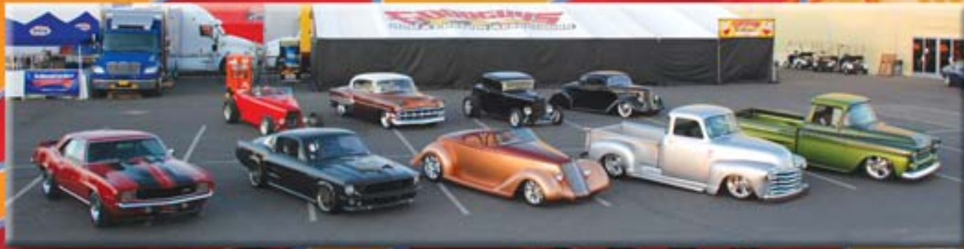
"Big Ten" at 2007 Goodguys Southwest Nationals