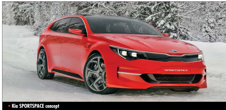
• Kia SPORTSPACE concept