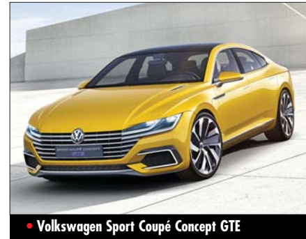
• Volkswagen Sport Coupé Concept GTE