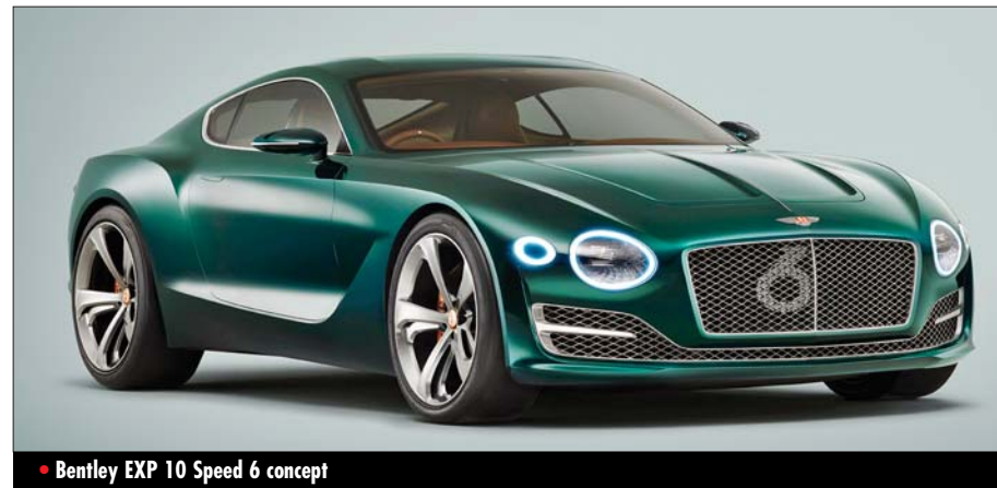
• Bentley EXP 10 Speed 6 concept

wagon, longer than a hatchback and lower to the ground than a crossover. Also shown was the new Kia cee'd GT Line , with their first 1.0-liter T-GDI engine and new 7-speed dual-clutch transmission. The cee'd is entering European production, and the SPORTSPACE seems likely to do so. We hope for North American versions of both.