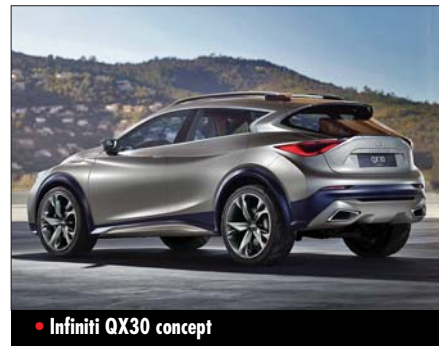
• Infiniti QX30 concept