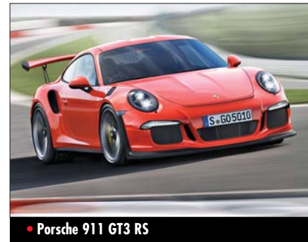
• Porsche 911 GT3 RS