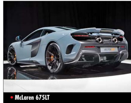
• McLaren 675LT