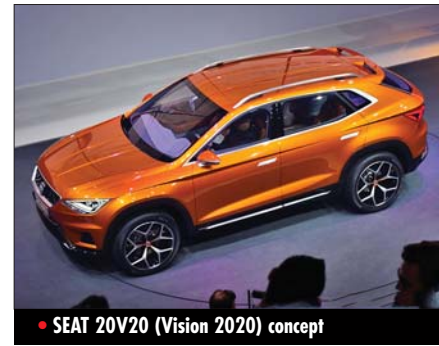
• SEAT 20V20 (Vision 2020) concept