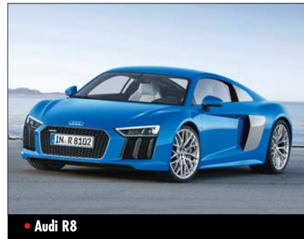
• Audi R8