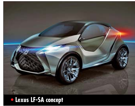
• Lexus LF-SA concept