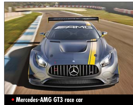
• Mercedes-AMG GT3 race car