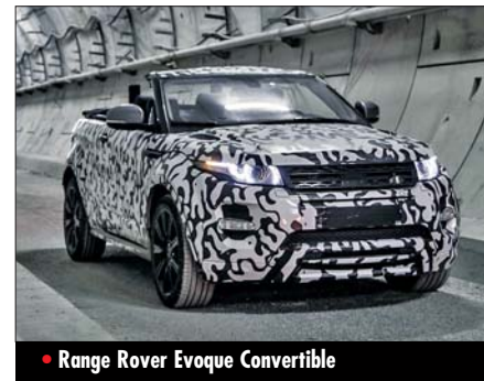
• Range Rover Evoque Convertible