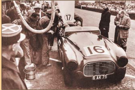
Chassis 0116/A in the pits at Le Mans 1951