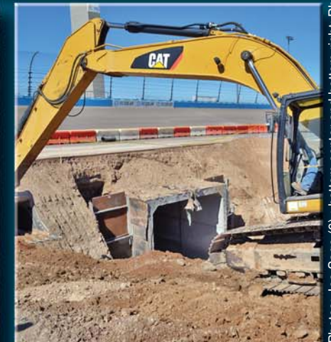
Lead photo: Phoenix Raceway