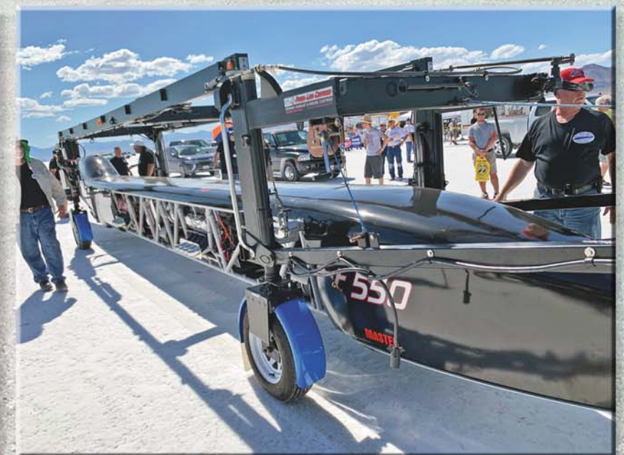
ABOVE: the 43-foot Target 550 streamliner sits in its moving transporter. Its 8,740 pounds must be carefully elevated and secured when being moved—the tires touch the ground only when the craft is on the starting line.