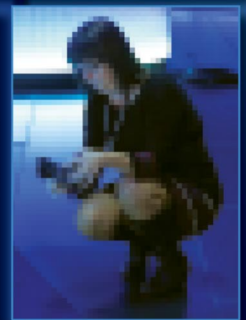
Spy photo by Joe Sage