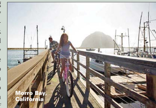
Morro Bay, California

resort credit per night starting at just $199/night. Enjoy cooling off at one of the resort's three gorgeous pools with ancient petroglyphs and stunning mountain vistas as backdrops. An adults-only pool at the spa is available with a spa treatment or cabana rental. At two all-ages pools, young and young at heart guests will love the