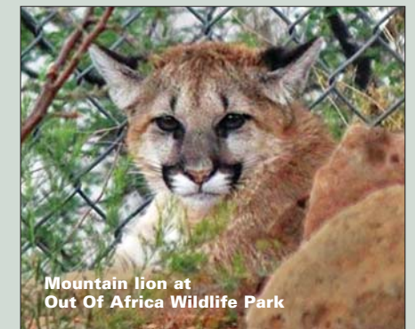
Mountain lion at Out Of Africa Wildlife Park