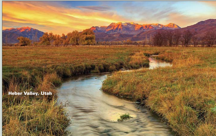
Heber Valley, Utah

▼ Summer is cool and green in the high mountain lakes and rivers around Heber City , where US 40 east of Salt Lake City meets US 189 north of Provo Canyon—a great destination with world class fishing and hiking. The Provo River is a premier blue ribbon trout fishery with rainbow and brown at record lengths, typically 18 inches or bigger. The river flows from the Uinta Mountains through Heber Valley and cuts Provo Canyon. Rocky Mountain Outfitters guide service for all levels can show you the best spots in the 5,000-fish-per-mile Provo River, year-round (hatches in summer and fall make this blue-ribbon river its blue-ribbonest). Deer Creek Reservoir State Park covers some 3,000 acres, and the entire shore has unrestricted public access. Jordanelle Reservoir State Park, well-known as a trophy smallmouth bass fishery, is popular with locals. Take the Heber Valley Historic Railroad to Vivian Park in scenic Provo Canyon (also home to Sundance Mountain Resort). Strawberry Reservoir, 23 miles southeast of Heber on US 40, supports one of the West's leading cutthroat fisheries and at 7,600 feet elevation is the state's premier cold-water fishery. About half of over 1,000 natural lakes and 400 miles of streams in the Uintas support game fish. Temperatures above 10,000 feet are rarely above 80 degrees in the middle of the summer. Night temperatures are commonly 30-40 degrees. It's a