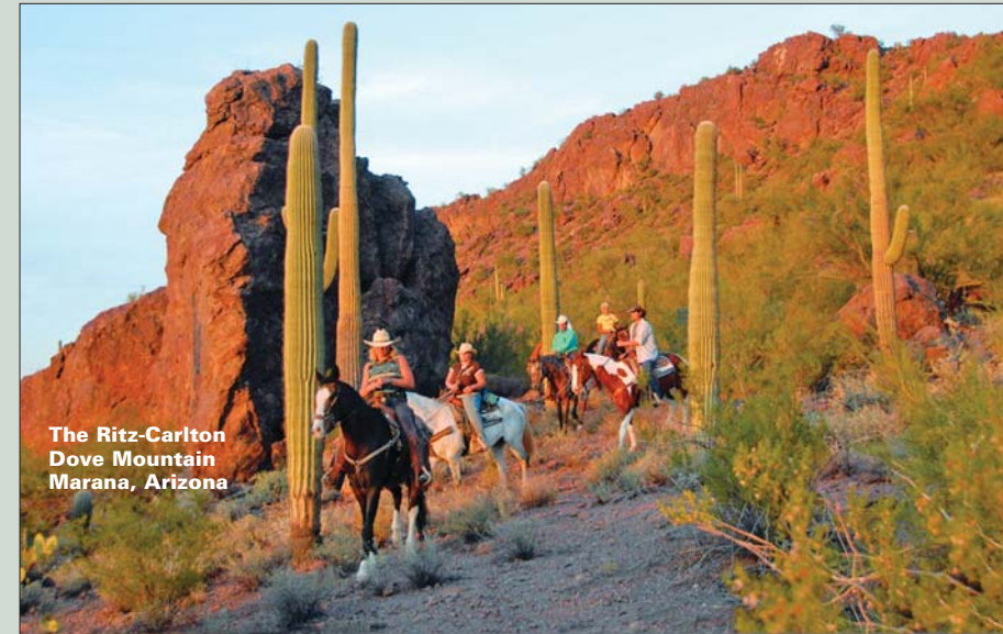
The Ritz-Carlton Dove Mountain Marana, Arizona

open to dogs, horses or mountain bikes, safety, trail etiquette and suggestions for hiking trips to other parts of Arizona. Pick up a copy at the Visit Phoenix Information Center, 125 N 2nd Street (Monday-Friday,