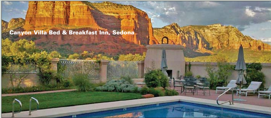
Canyon Villa Bed & Breakfast Inn, Sedona