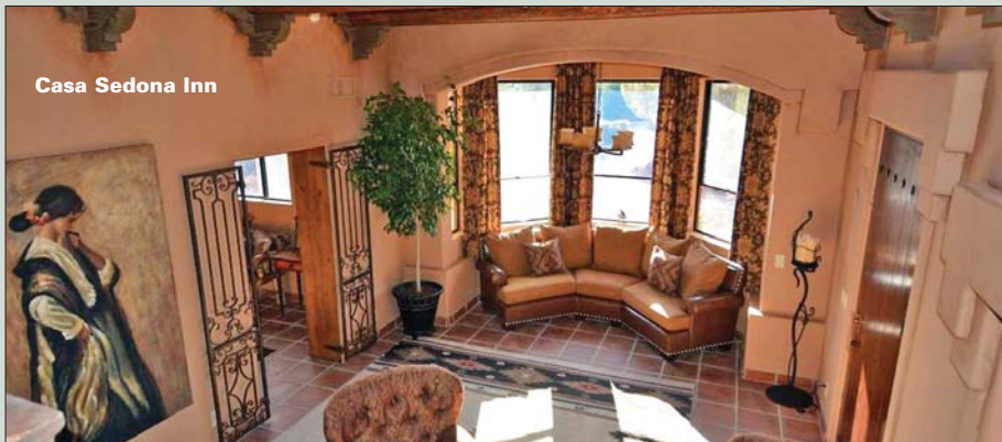
Casa Sedona Inn

▼ Bed and breakfasts and inns are popular ways to immerse in Sedona like a local. Wake to a chorus of birds or the cascade of water over stone, then explore the verdant woodlands in your back yard. In warmer months, cast a fishing line in the creek or take a dip in your own personal swimming hole. Something about the setting inspires innkeepers to create little masterpieces of lodging. Quaint accommodations include fireplaces, private hot tubs, architectural flourishes, unique decor and personal artistic touches, all with an emphasis on guest services. There are plenty of options for bed and breakfasts. | A Sunset Chateau embodies timeless elegance with Old World comfort and charm. | Award-winning Lodge at Sedona—A Luxury B&B Inn has an estate setting on two acres of gardens among mature evergreens, waterfalls and rock formations. Guests can also explore the property's on-site labyrinth. | At Canyon Villa Bed and Breakfast Inn, magnificent views of Bell Rock and Courthouse Butte loom over a glass-tiled swimming pool and landscaped gardens. Here, guests enjoy a full three-