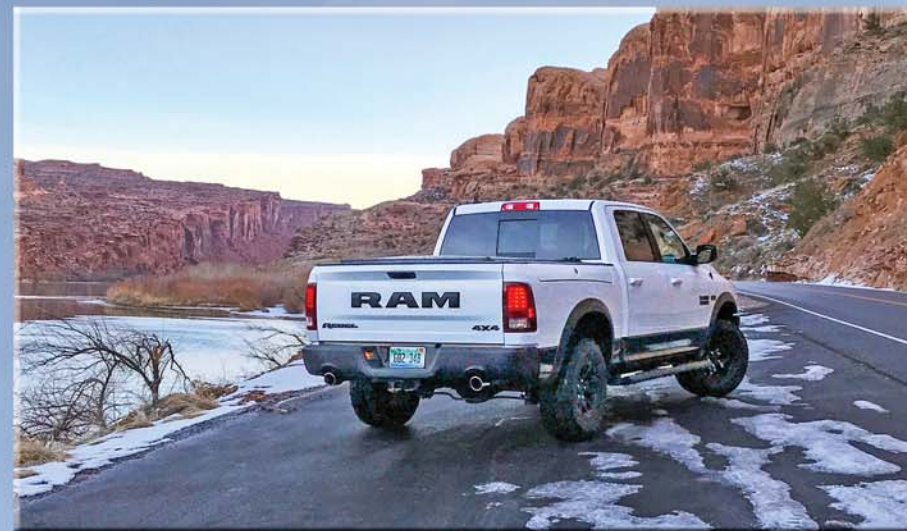
(Below) Monument Valley, the ultimate Western panorama, is a Navajo Tribal Park. Though its image shouts "Arizona," it's mostly in Utah. // (Above) Fisher Towers Road and the Colorado River outside Moab. // (Right) Cameron Trading Post in northern Arizona; I-70 through Glenwood Canyon, Colorado.

NAVAJO NATION: North on US 89, about half-way from Flagstaff to the US 160 turnoff, you cross into the Navajo Nation, which the route traverses for almost as many miles as the Arizona portion to