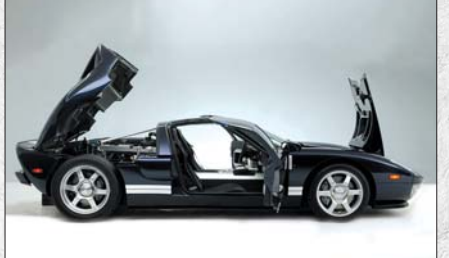
Ford's very own supercar certainly has added something to their lineup. We have early word on a special edition due for 2006. We'll bring you info on development and new rumors.