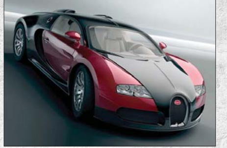
Can't wait? Neither can we. We'll bring you details on about 300 vehicles from about 50 manufacturers, spread out over two issues. Stay tuned to see what gets your blood pumping.