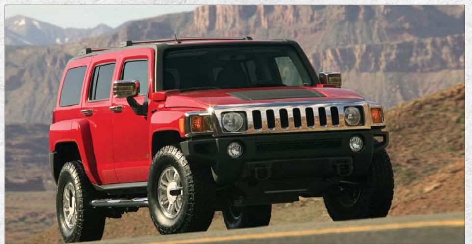
2006 New Model Year Preview