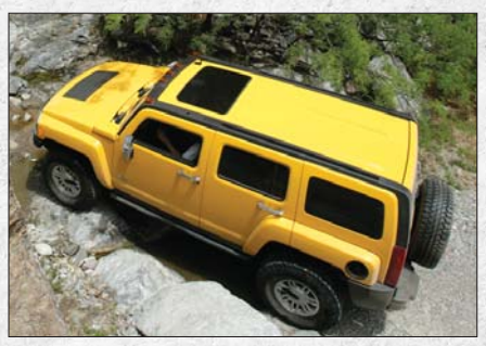
In a realm that is largely based on in-your-face size, Hummer's lineup paradoxically keeps coming out with something smaller. We'll be reporting on the newest one: the H3.