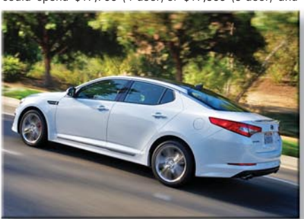
have SX features, but you could not drive that stick. Now you can.

Prior to this, a manual was only available on the lowest-rung Rio, the LX (base price of $13,600 for the 4-door or $13,800 for the 5-door, $1100 lower than the automatic LX). Moving through an EX to the SX, you could spend $17,700 (4-door) or $17,900 (5-door) and