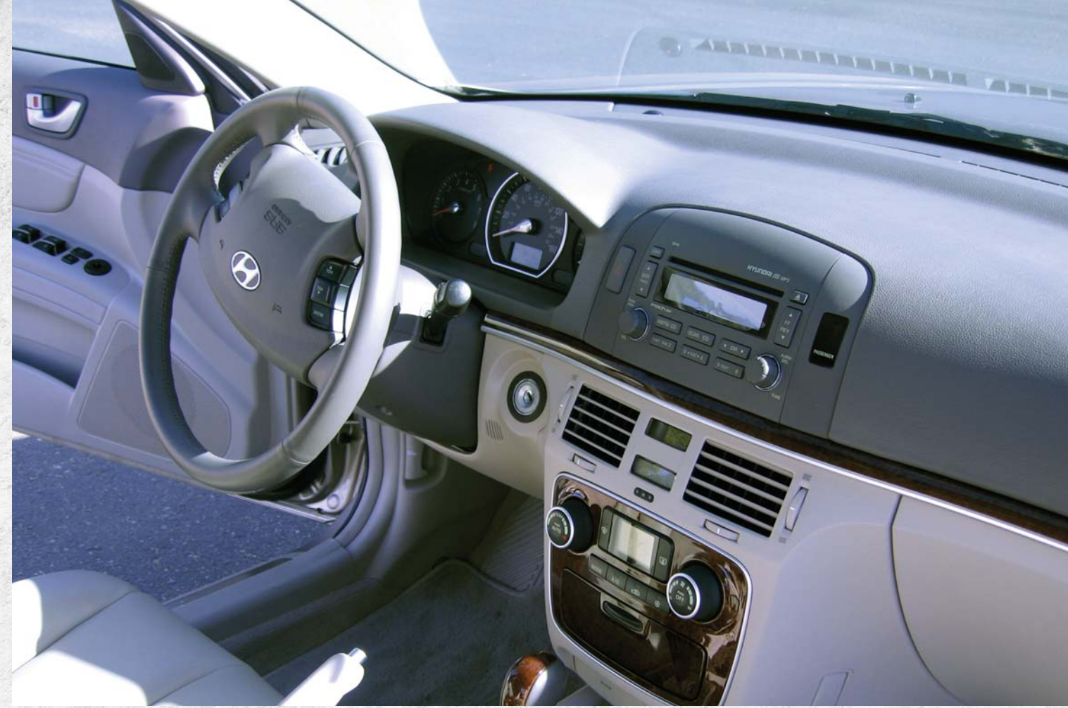
The new larger 2006 Hyundai Sonata has 121.7 cubic feet of interior volume to move it out of the midsize rating and into the EPAs "large car" category.

his is Hyundai's top-of-the-line sedan, and surely a symphony was more work and of more significance to Ludwig von Beethoven than a sonata; but truly, Hyundai has come to the table with a significant step into the broader marketplace, with the 2006 Sonata.