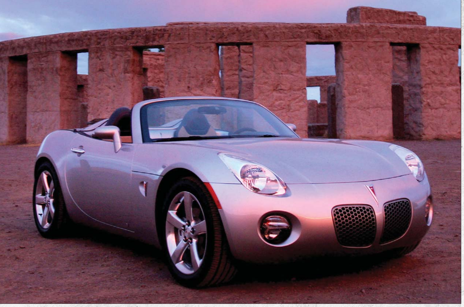
The Pontiac Solstice is mounted on top of a rigid frame which provides for an efficient short and long arm suspension at all four wheels. This setup is a fundamental engineering factor in providing the new two-seat roadster with its excellent handling characteristics and road feel.

than a sports car. Nevertheless, the 170 horsepower does a very good job with 0 to 60 mph acceleration times arriving in 7.4 seconds. For those of us who always cry for "more power" there is a turbocharged version in the works with an estimated 260 horsepower. That should really make the Solstice a standout.