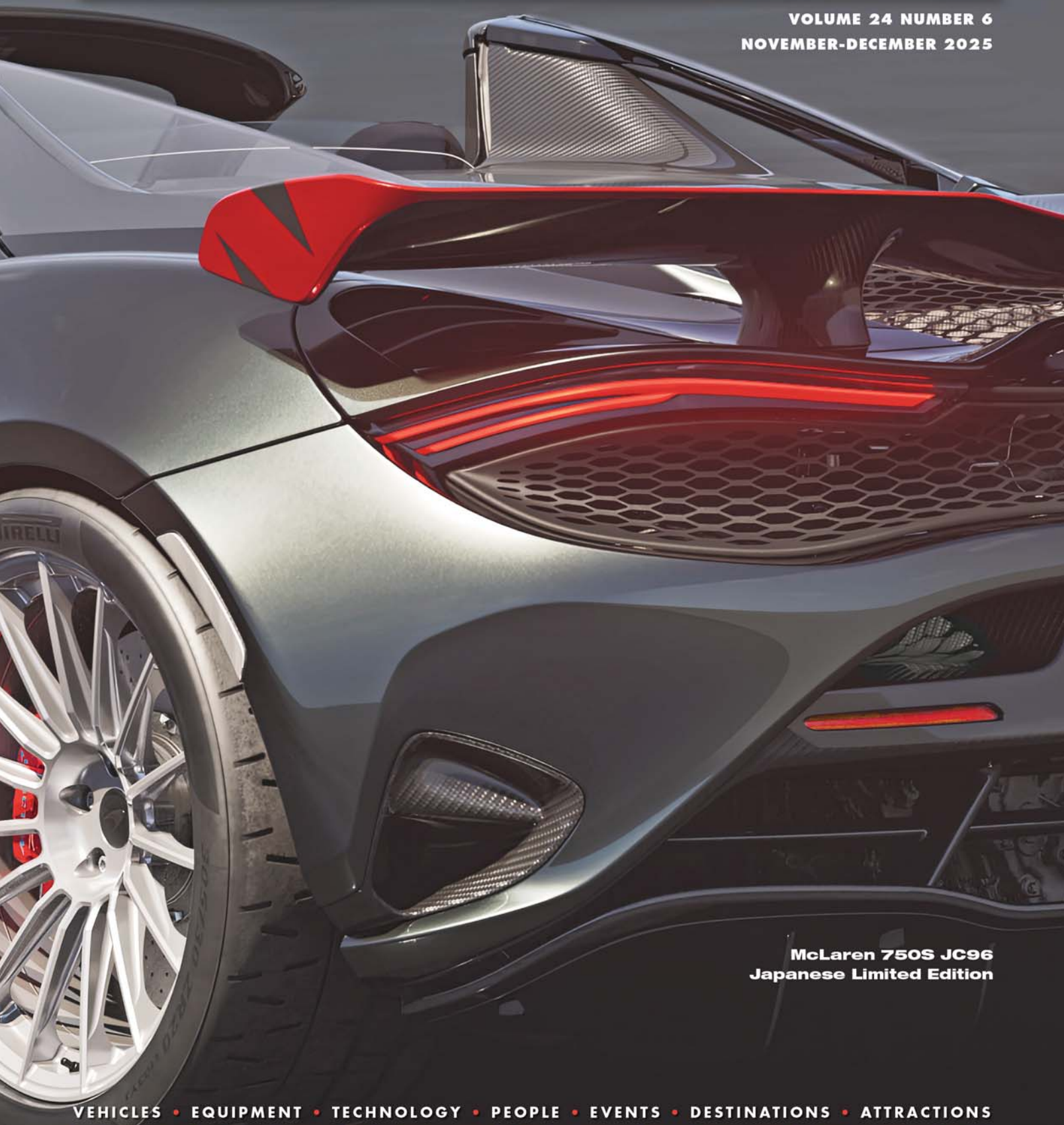
McLaren 750S JC96 Japanese Limited Edition

VOLUME 24 NUMBER 6 NOVEMBER-DECEMBER 2025