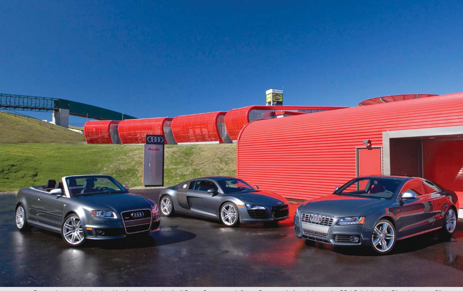
Featured cars parked and waiting for action at the Audi Forum Sonoma, at Infineon Raceway. Left to right are the RS 4 Cabriolet, the R8 and the new S5 coupe.

car Experience allows participants to test and sharpen their driving skills and push our cars in a controlled environment. There is no better way to demonstrate the foundation of this company than behind the wheel and on the track."